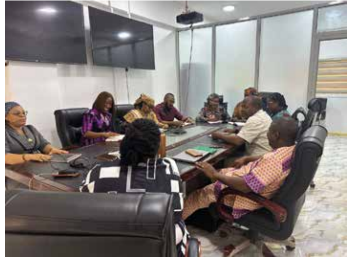
Nigeria Health Watch team, Resolve to Save Lives with Epidemiological Unit, Federal Ministry of Health and Social Welfare