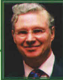
Lord Nigel Crisp

Teaching Hospital in 1984 and between 1988 and 1994; he was Director-General of the Federal Ministry of Health. He returned to clinical practice and in 2003 and was appointed Chairman of the Medical and Dental Council of Nigeria and Chairman of the Medical & Dental Practitioners' Disciplinary Tribunal between 2004 and 2008. He is on the Board of two non-profit organisations that work to improve the quality of life for the underprivileged of the world: The Society for Family Health (Nigeria) and the Population Services International (USA). In addition to several Short Term Consultancies for the World Health Organisation, he has served the Federal Republic of Nigeria in several capacities most recently as Chairman of the Health Thematic Group, National Technical Working Groups on Vision 20, 2020 (April – July 2009). In 2005 he received the National Honour; Officer of the Federal Republic (OFR).