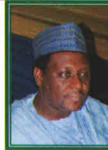
Dr. Mohammed Ali Pate

chaired an international Task Force on increasing the education and training of health workers globally. He was both Chief Executive of the NHS from 2000 to 2008 and Permanent Secretary of the Department of Health and led major reforms in the English health system. A Cambridge philosophy graduate, he joined the NHS in 1986. He is a member of the Health Worker Migratory Advisory Council, a Champion Advocate for the Global Health Workforce Alliance and an Advisory Board Member of the African Centre for Health and Social Development. He also chairs Sightsavers International, is a Senior Fellow at the Institute for Healthcare Improvement in Cambridge Massachusetts, an Honorary Professor at the London School of Hygiene and Tropical Medicine and an Honorary Fellow of St John's College, Cambridge and of the Royal College of Physicians.