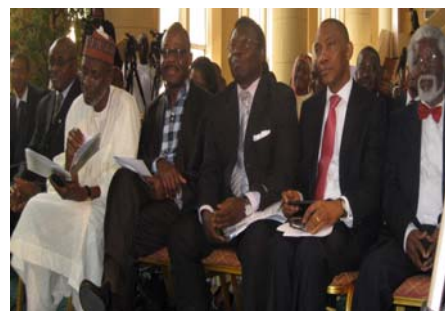
Cross section of participants at the book launch

The representative of the Hon. Minister of Health, Permanent Sec-