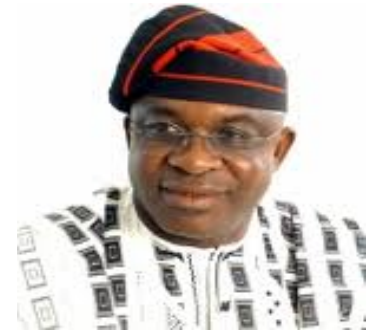
SENATE PRESIDENT, DAVID MARK

HERFON in her usual watchdog role in the health sector will not cease from holding government accountable. We are gathering additional information to identify system failures that resulted in the outbreaks and proffer evidence based policy recommendations.