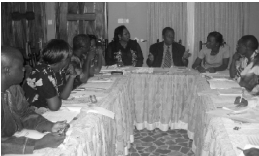
*Training Manual review workshop: November 2004

workshop based on participants' comments and lessons learnt. After the pre-testing of these materials in each workshop, these training materials formed the kernel of the training manual developed by independent consultants who were notable media scholars or HIV/AIDS experts in their own right.