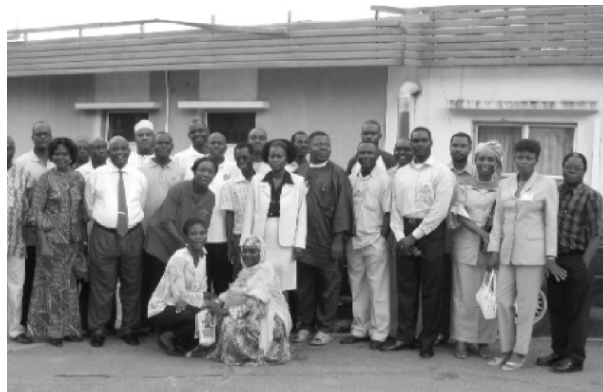
* Members of the Guild of Editors at the training workshop; Calabar, September 2004

The Jigawa Chapter of NAWOJ has also set up its own Action Committee, but