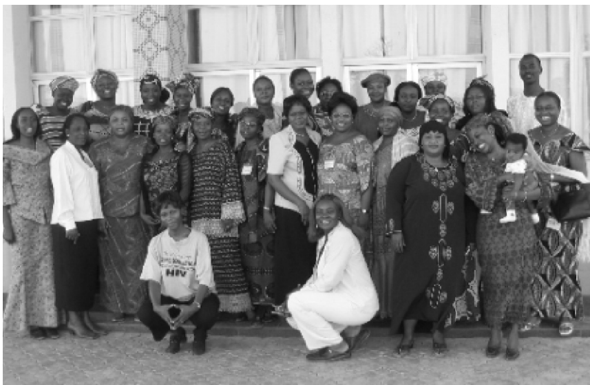
* Participants at the training workshop for NAWOJ; Lokoja March 2004

14 Four training workshops were organized for the three media associations. Two of the workshops (one in the North and one in the South) were organized in partnership with the NUJ because of its numerical strength, while one each held for NAWOJ and NGE. The trainings targeted the leadership of all the associations at the national, zonal/regional and state levels; in some cases, active members who were not necessarily members of the national or state councils attended.