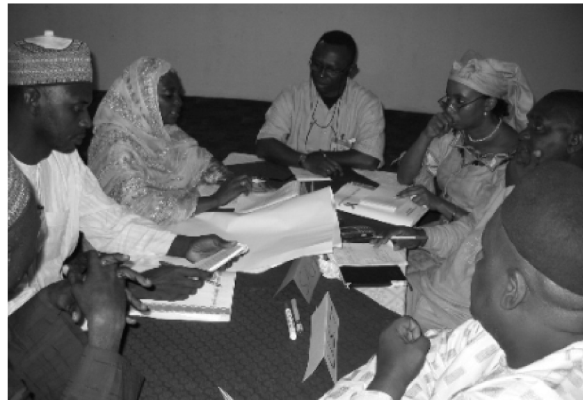
* Journalists at a group session ... during one of the workshop