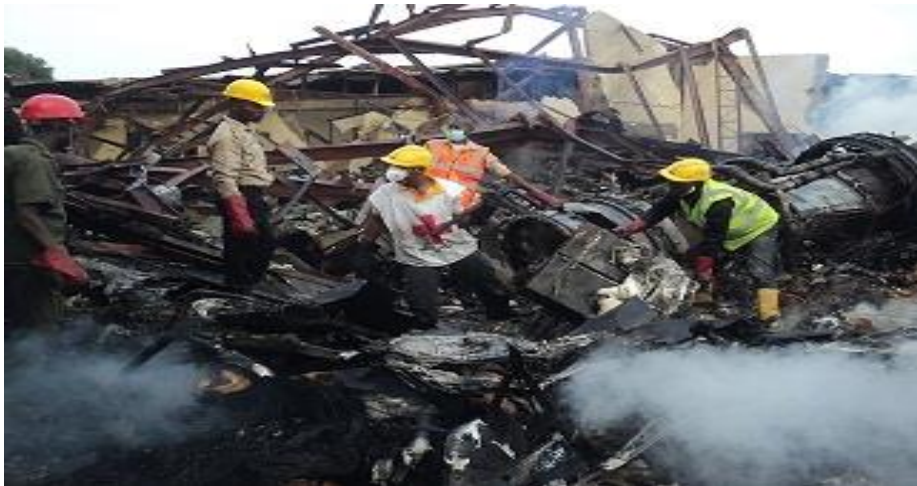
Red Cross volunteers and other stakeholders at the Dana plane crash site

On the 3 rd of June 2012, at approximately 3:43pm, a Dana plane crashed into a residential area while attempting an emergency landing in Lagos, killing all 153 passengers and crew on board. The crash site was in a heavily populated urban area and resulted in the death of at least 4 persons who were inside the buildings at the time of the crash, bringing the total number of deaths to 157 people, and 6 injured.