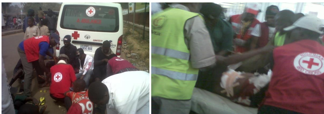
NRCS volunteers at work

The Federal government announced on January 1 st 2012 an increment in the pump price of petrol (PMS) and as a result, there were protests and strike by the Nigerian Labour Congress in different parts of the country with Kaduna, Kano, Lagos, Oyo and the FCT being more tense than other states. Consequently, it resulted in about 596 injured and 30 dead. The NRCS National Headquarters responded by putting branches on alert and monitored the situation until the strike was called off. The ICRC supported the National Society with communication support for the branches and also pre-stocked dressing kits in three branches of Borno, Gombe and Kano. Part of these prepositioned items were utilised during the response.