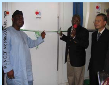
UNICEF Assistant Country Representative, Lagos State Commissioner for Health and Japan Embassy Minister Commissioning the new walk-in cold room for Lagos State

New 'walk in' vaccine cold rooms were commissioned in Lagos and