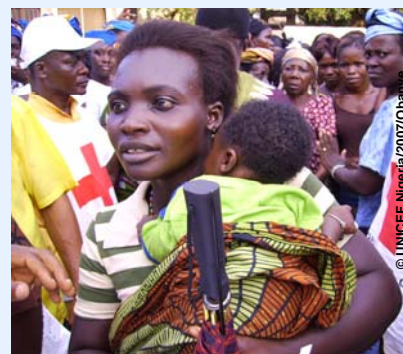
A mother holds her baby as she waits for assistance at one of the camps in Anambra State.

In mid-September forty-two communities in Anambra West and East Local Governments Areas (LGAs), were hit by the floods which displaced an estimated 22,000 persons. Some were reported to have drowned. Schools, houses, health centres and churches were submerged by the flood. The high waters made it particularly difficult for emergency services to reach the large number of people that were affected. For weeks, movement to the affected communities was only possible by canoe while some communities remained inaccessible