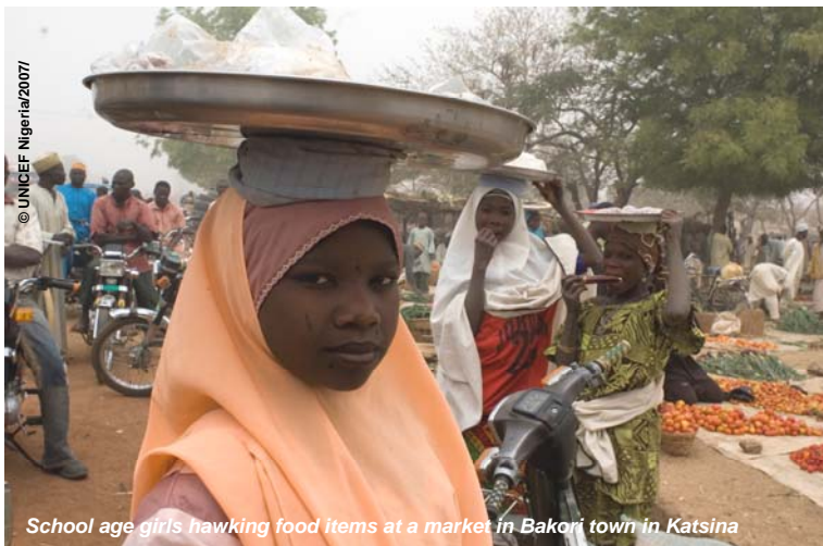
School age girls hawking food items at a market in Bakori town in Katsina

Many girls that do not attend school in Northern Nigeria are sent to 'Islamiya' schools where they receive religious training from the Qur'an. The