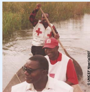
UNICEF partnered with the Red Cross to reach areas left inaccessible by the floods in Anambra State.

In mid-September forty-two communities in Anambra West and East Local Governments Areas (LGAs), were hit by the floods which displaced an estimated 22,000 persons. Some were reported to have drowned. Schools, houses, health centres and churches were submerged by the flood. The high waters made it particularly difficult for emergency services to reach the large number of people that were affected. For weeks, movement to the affected communities was only possible by canoe while some communities remained inaccessible