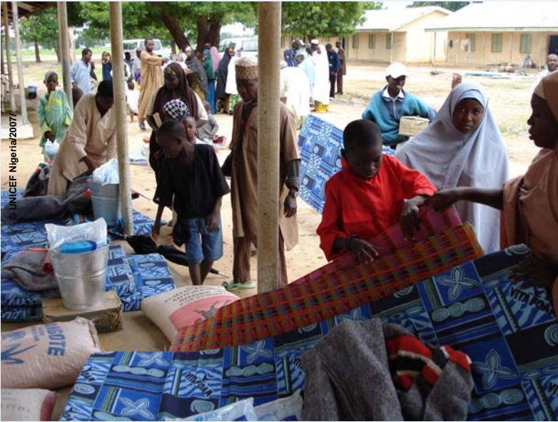
Families displaced by the floods take stock of supplies provided by UNICEF at a camp in Misau local government area of Bauchi State.

Following heavy rains which swept through the ten states supported by the UNICEF Field Office in Bauchi, over 100,000 persons are believed to have lost their homes, hundreds of acres of farmlands, crops, livestock and other valuable property. Water sources were polluted, schools, places of worship and bridges were destroyed. Many people were also reported dead. Plateau was one of the worst hit with 56,571 persons estimated to be affected and over 100 deaths reported. In Bauchi, 12 LGAs were inundated and an estimated 31,000 persons displaced, mainly women and chil-