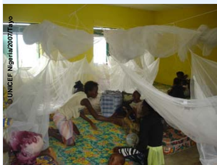
One of the female rooms at the Lagos camp with Long Lasting Insecticide Nets donated by UNICEF.

Continuous rainfall caused a major flood in Ogun State at the end of July. Many houses and bridges along the river bank were washed away, rendering occupants of over 260 houses homeless. About 472 families were displaced. The State Government responded immediately to the situation, organizing a camp for affected persons at the State Technical College, Oke-Iba, in Abeokuta, the State capital. By