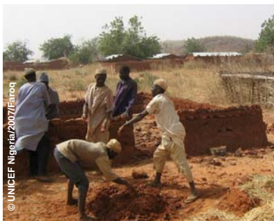
School based management committee members of Dagwarga Ubandawaki building a library for the school.

After a grueling two-hour journey on a rocky desert path, we arrived at Dagwarga Ubandawaki, a rural community in Sokoto State. Normally, we would go to see the village head first but this time we headed for the school premises, attracted by a group of men working on a building construc-