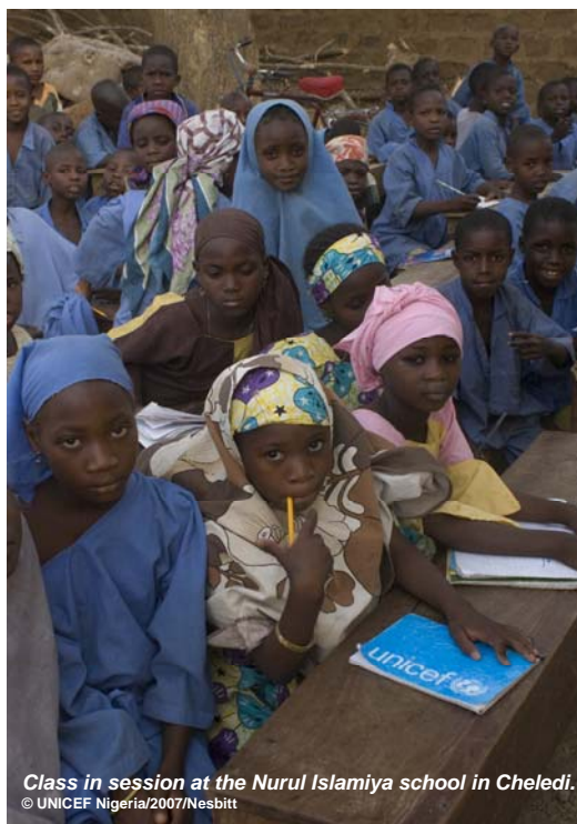
Class in session at the Nurul Islamiya school in Cheledi.