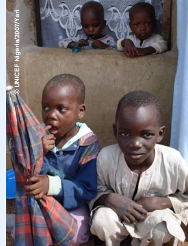
Children displaced by the floods in Bauchi State.

UNICEF staff visited the camps in Plateau, Bauchi and Borno States and gave de-worming tablets to children and pregnant women there.