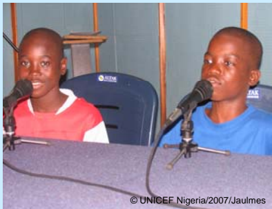
Children living on the streets of Lagos record a programme in the FRCN studio as part of a UNICEF supported training workshop.

UNICEF has supported the Child-to-Child network and Radio Nigeria, to mobilise, counsel and train 45 street children in basic media skills and radio production techniques so they can poignantly and with minimum support tell the stories of their lives, their fears, frustrations and hopes for the future.