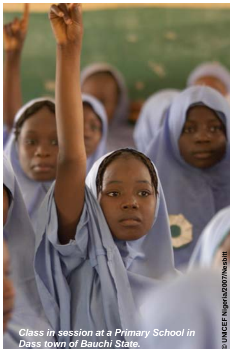
Class in session at a Primary School in Dass town of Bauchi State.