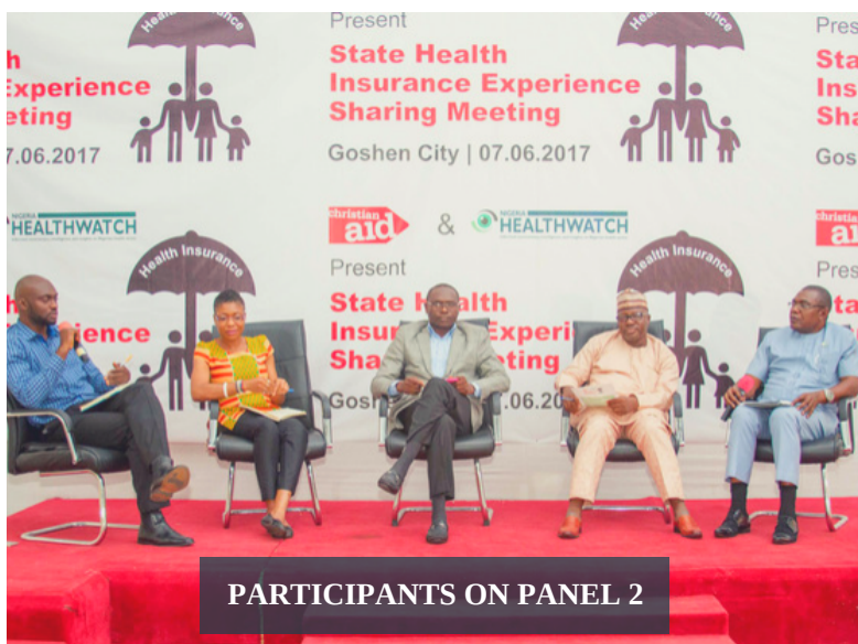
PARTICIPANTS ON PANEL 2