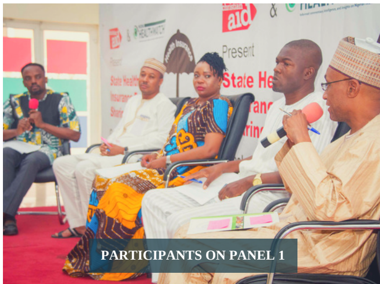
PARTICIPANTS ON PANEL 1