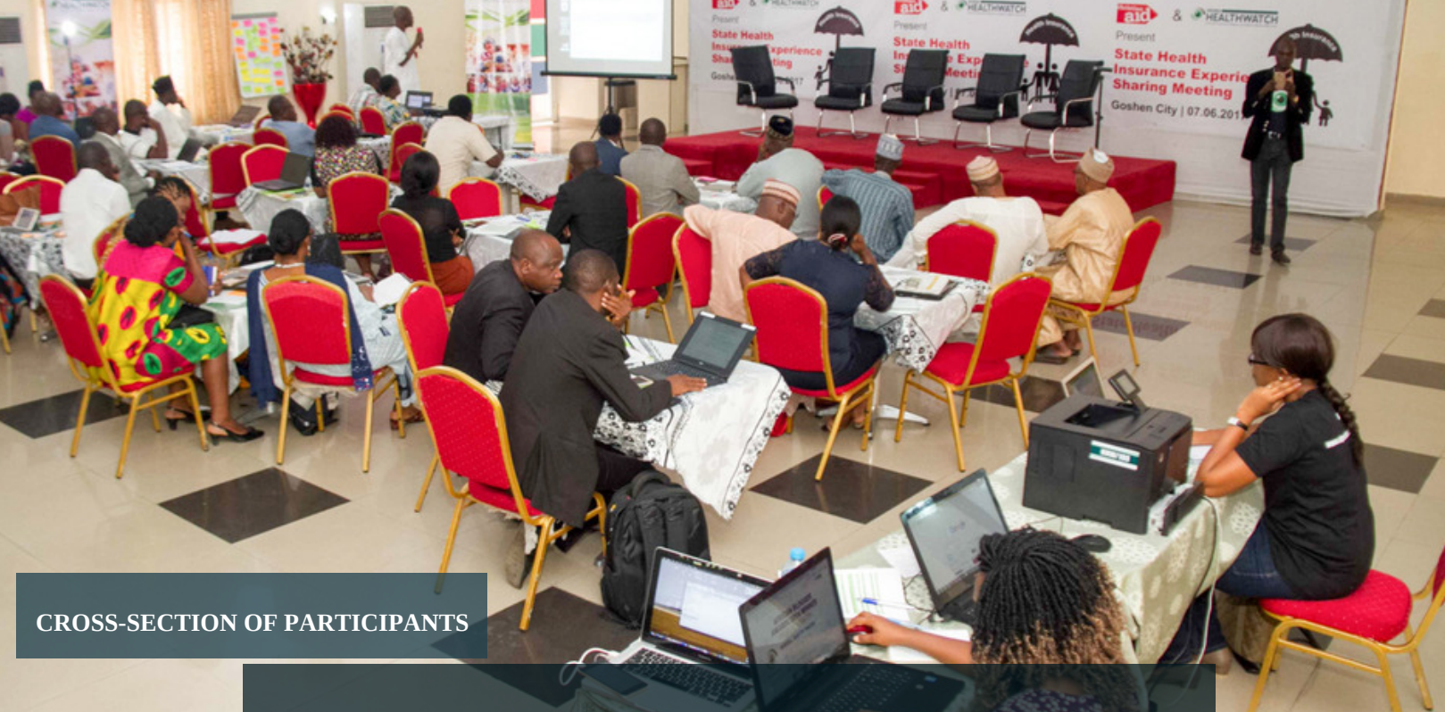
CROSS-SECTION OF PARTICIPANTS