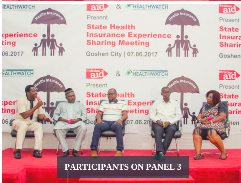
PARTICIPANTS ON PANEL 3

Seven States shared their experiences of health insurance laws. Three have already signed their laws, three are in the process of signing their laws while one is about to begin. All seven States shared policy options.