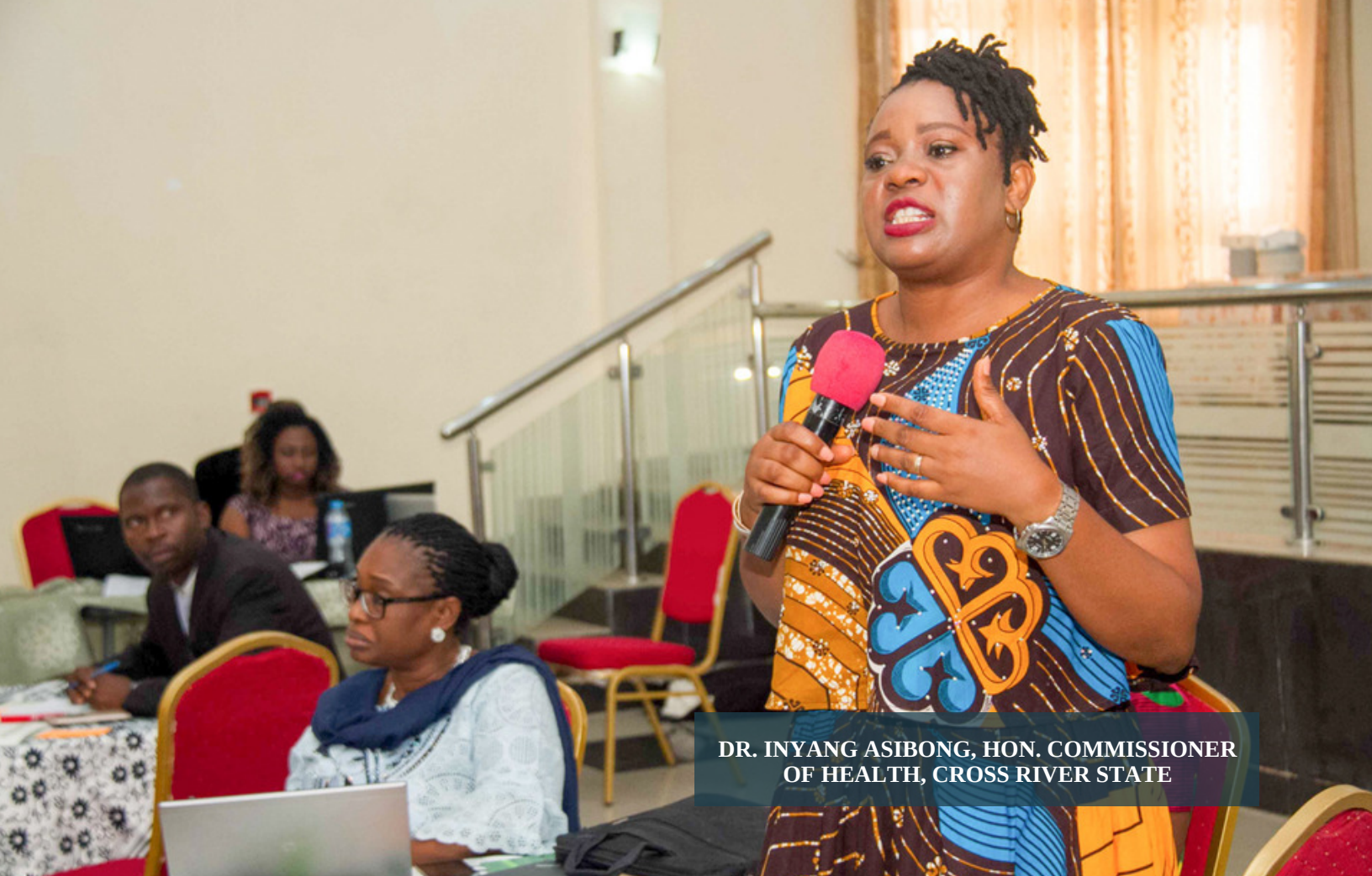
DR. INYANG ASIBONG, HON. COMMISSIONER OF HEALTH, CROSS RIVER STATE